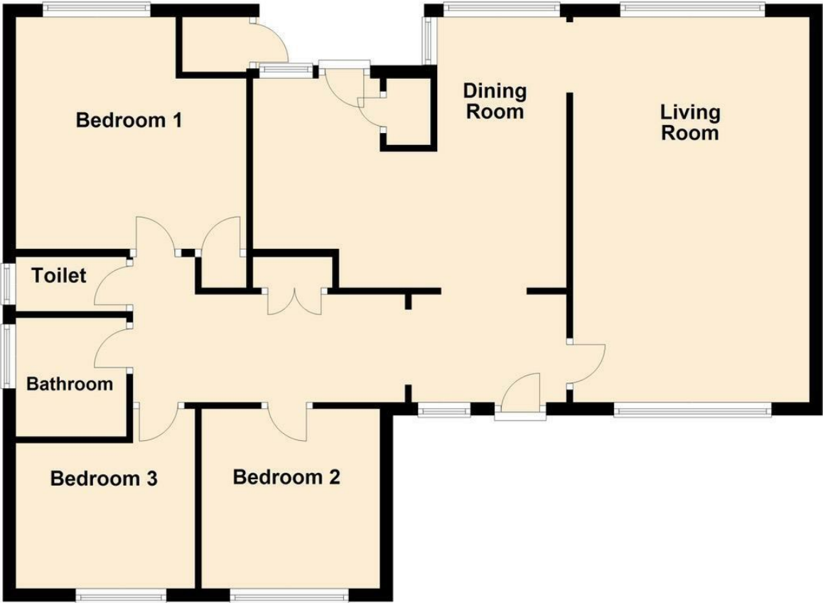
SKETCH PLAN FOR ILLUSTRATIVE PURPOSES ONLYAll measurements are approximate. Plan produced using PlanUp.